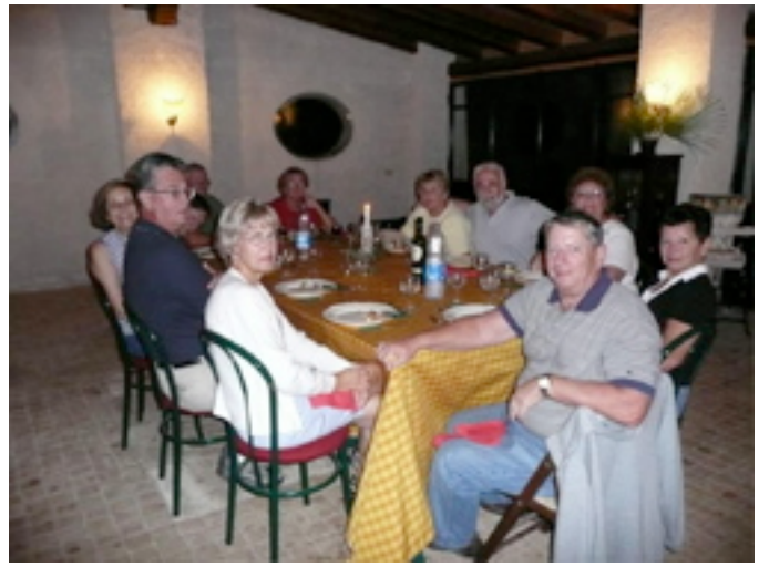
Dinner at the villa