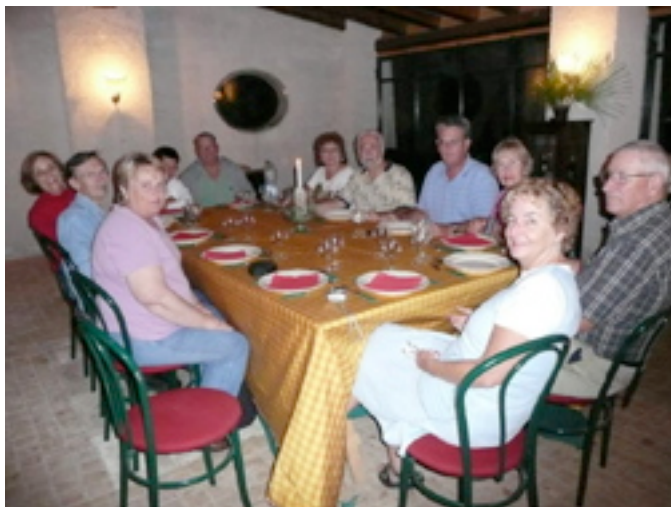
Our villa - La Massaria Cucco

In large bowl, cream butter until light and fluffy. Add sugars and mix thoroughly. Add peanut butter, eggs, vanilla, baking powder, baking soda, salt and flour. Shape dough around each bite-size Snickers bar, making sure candy is completely covered. It won't take a large amount of dough to do this. Bake 13 to 16 minutes. Makes 60 cookies.